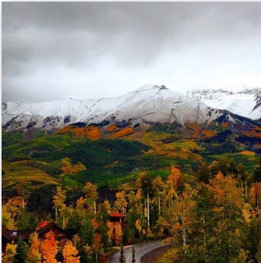
Beauty of fall