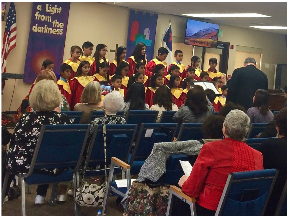
7th Day Adventist Children's Choir