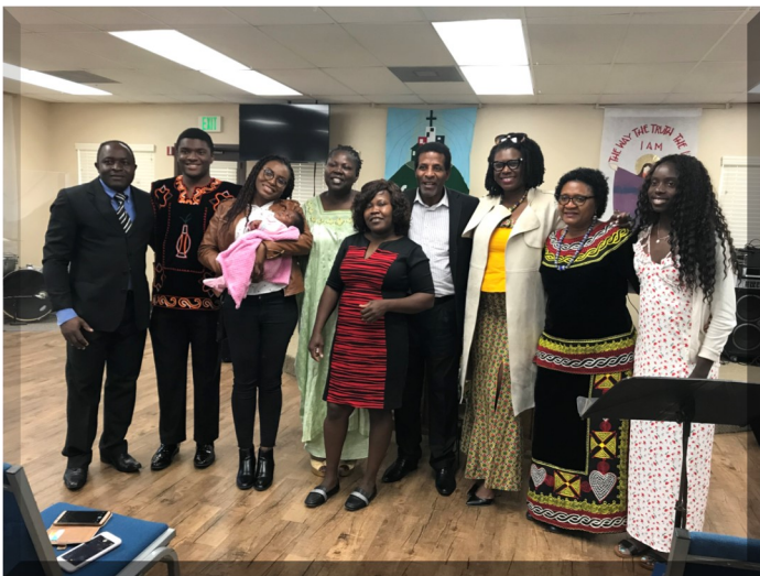
International Theological Seminary visit on January 12